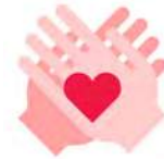
Not for profit